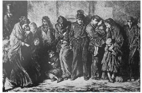
OVERCROWDING IN THE STREETS AS THE POPULATION OF LONDON ROSE TO EXTREME AMOUNTS.

During the first half of the nineteenth century Great Britain was adjusting to the effects of the Industrial Revolution, when the previously farming economy of the country changed to one relying more on industry and manufacturing. Britain underwent a period of swift urbanization, the movement of large populations from the countryside to cities. Scores of young men and women were drawn to London by the promise of work and entertainment. The rural poor were also attracted to the city, seeking employment or at least a dry place to sleep. Between 1800 and 1850 the population of London doubled, topping 2.3 million people.