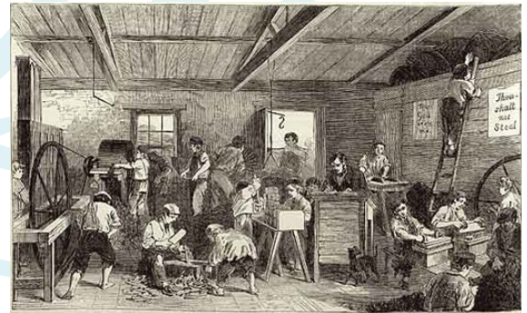
A CHARITY SCHOOL

Education in the Victorian Era was a privilege enjoyed by those who could afford it. In many cases money was so scarce that children from poor families were sent to work in factories as soon as they were old enough. Whenever possible, these children would attend charity schools (called ragged schools ), where they were taught basic mathematics, reading and scripture.