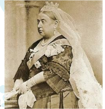
QUEEN VICTORIA IN HER PRIME

Unlike the democracy that exists in America, England has a constitutional monarchy. Today, Queen Elizabeth II rules England. In Dickens' day, Queen Victoria ruled the country. Under her direction, England gained control of India, Burma, New Zealand and Hong Kong, making England a very strong imperial power in the world. While Victoria did many good things to help out her country, her main weakness was her willingness to let the rich become richer and work less and to let the poor work themselves to death.