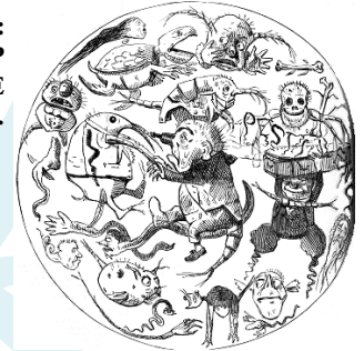
A COMIC FROM 1850: A MAGNIFIED DROP OF WATER FROM THE THAMES.

There are many Christmas traditions and celebrations that are seen in A CHRISTMAS CAROL : Fezziwig's party, the gathering at Fred's and the Cratchit family dinner. What traditions does your family celebrate? Have you started any new traditions? Write briefly about a special tradition or celebration that you enjoy.