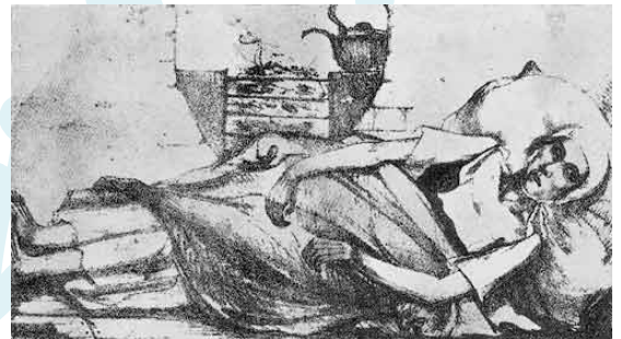
ONE OF THE FIRST CHOLERA VICTIMS IN ENGLAND: A GIRL WHO DIED IN NOVEMBER, 1831.

The city's health problems were compounded by the ignorance of its medical professionals. At this time, doctors believed that disease was spread through tainted air rather than water. Throughout the 19th century, it was widely accepted that proper ventilation was the key to preventing disease. Hospitals were also of little help because they were few and far between and often times unaffordable as well as unsafe. Due to crude surgical techniques and a flawed understanding about the nature of infection, the spread of hospitals led to an increase rather than a reduction in the death rate. According to mortality statistics, it was actually safer to deliver your baby at home than in a hospital.