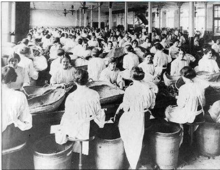
WOMEN IN A FACTORY ROLL CIGARS FOR HOURS ON END

Life was difficult for the working class in Victorian London. While a typical work week is about 40 hours, in Victorian London it was not unusual for employees to work six twelve-hour days or 72 hours per week. Most workers were given days off every Sunday, May Day, and Christmas. However, businesses were not required to give their employees these days off so some unlucky souls had to come to work no matter what. In Dickens' time, a typical clerk made about £80 (around $130) per year, just enough to rent a house and raise a family. In A Christmas Carol , Scrooge pays his clerk Bob Cratchit "fifteen bob a week" or about £39 per year.