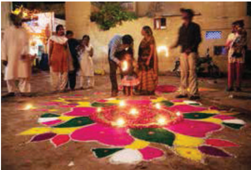
A Diwali celebration in Pakistan