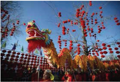
A Chinese New Year parade

Christmas is not the only holiday people celebrate during the winter months. There are many different festivals and holidays that celebrate the season. While some traditions such as St. Lucia Day (Sweden), Las Posadas (Mexico), and St. Nicholas Day (Europe) are extensions of the Christmas celebration, holidays in the wintertime are as varied as the cultures and peoples of our world.