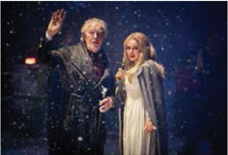
"A Christmas Carol," Doctor Who, 2010