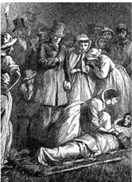
Illustration from Hard Times, 1854

The Victorian era is named for Queen Victoria, England's second longest reigning monarch, who ruled from 1837 to 1901. Regarded as a great monarch, Queen Victoria worked to improve the lives of the poor, expand education, and secure England's place as an economic and industrial superpower. Even though Victoria was a strong ruler, many of her subjects led difficult lives, as poverty, poor working conditions, and disease were commonplace.