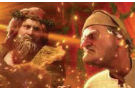
Disney's A Christmas Carol, 2009