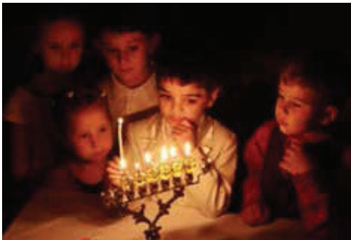
Children light the Hanukkah menorah