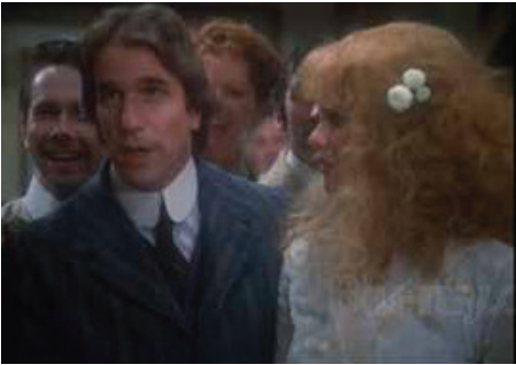
An American Christmas Carol, 1979

A Christmas Carol has had many different adaptations over the years, from films to stage plays to television show episodes to comics to other literary versions. The themes of goodwill, charity, and the power of the Christmas spirit have made A Christmas Carol an appealing story for many different mediums.