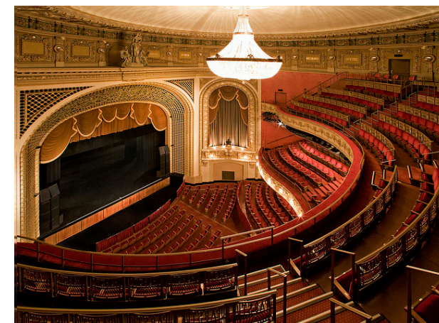
Interior of the Pabst Theater

In 1989, The Pabst Theater was connected to the Milwaukee Center, which houses The Rep's offices and theaters. The Pabst continues to serve as a busy concert and performing arts venue.