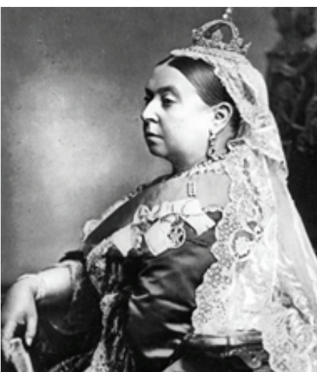
Queen Victoria, 1887