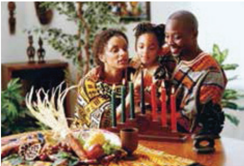
A family lights the Kwanzaa kinara