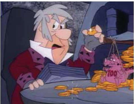
A Flintstones' Christmas Carol, 1994