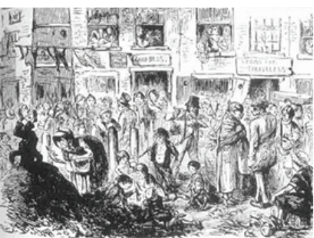
A Court for King Cholera, political cartoon by John Leech, 1852