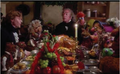
The Muppet Christmas Carol, 1992