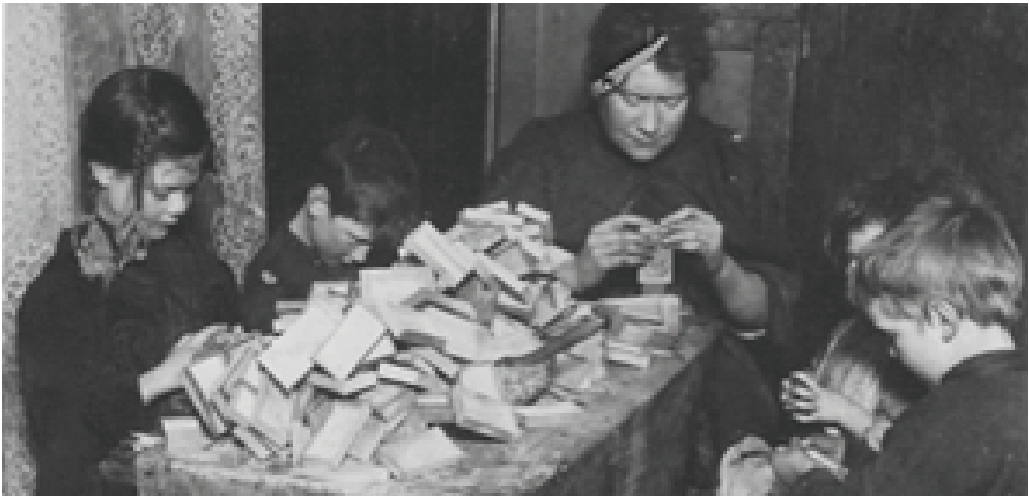
A Victorian family making matchboxes

Dickens criticized many of these social problems in his works. From the portrayal of the lives of the working class in Hard Times to the poor Cratchit family in A Christmas Carol , Dickens drew attention to the problems of the lower classes with his novels and stories. As a popular and prolific author, Dickens' pen gave voice to those without much power of their own.